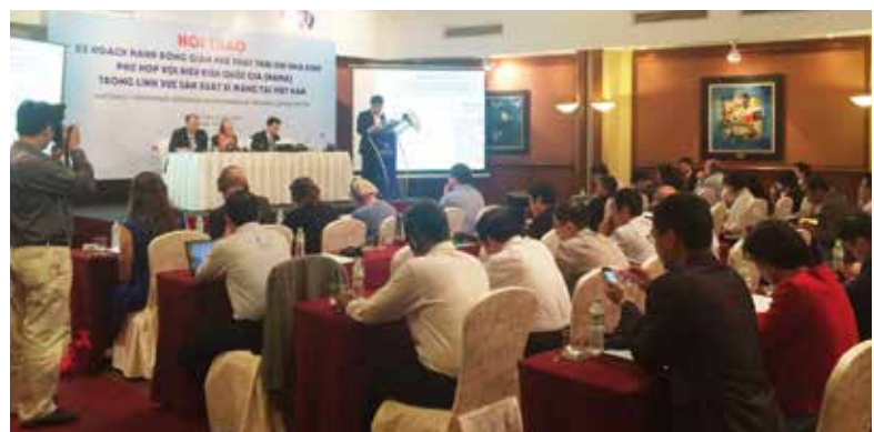
NAMA Readiness Programme in Vietnam Cement sector project

The database forms the basis for the NAMA’s MRV system and has been developed in line with best international practices as developed by the Cement Sustainability Initiative (CSI) of the World Business Council for Sustainable Development (WBCSD). To effectively implement the sector-wide MRV system it will be necessary to establish a legal obligation for all cement companies to participate, while improving the quality and credibility of current in-plant monitoring practices.